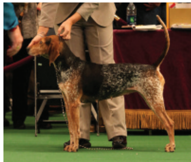
American English Coonhound