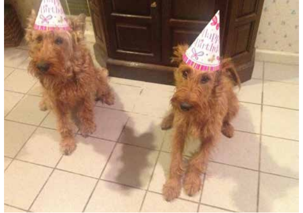
Cassidy, (Den Brook Happy Hopalong Cassidy) pictured on right, celebrating her first birthday with her mother, Fiona, (CH. Irish Rose Mary Maiden) age 5.