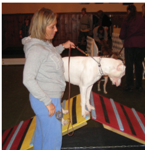
Baby, a white deaf pit bull mix, relaxing left and focusing on the task at paw, right.

and problem solving these last seven weeks...when baby doesn't respond to traditional training cues, we get inventive...roll your wrists like an NFL umpire and Baby does a fast recall...he responds to body language and vibrations from the floor...he still does puppy play and